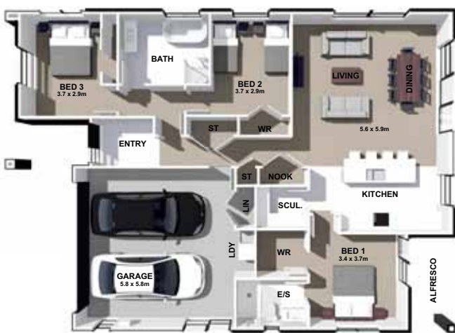
Lot size: 467m 2 | Levels: 1 | Plan: Maple